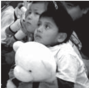
Hawthorn Kindergartners were spellbound during the special programs that were held in conjunction with their Be Excited About Reading (B.E.A.R.) program