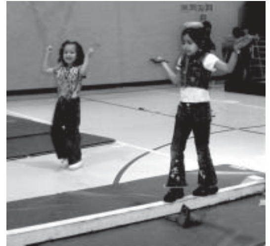
Students at Hawthorn Elementary North worked on balance in their physical education classes. With friends to cheer them on, they showed great concentration and skill.