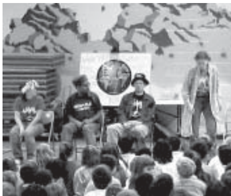
Child's Play Touring Theatre both entertained and educated as they presented a master class on creative writing at Hawthorn Elementary South.

Nonprofit Org. U.S. Postage PAID Mundelein IL Permit No. 211