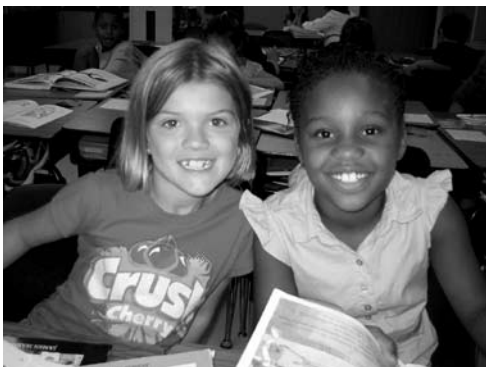
Summer was fun, but Hawthorn students are glad to be back with friends in their classrooms.

Residents are reminded that Board of Education meetings are rebroadcast on Vernon Hills cable, channel 4, at 6:30 p.m. on Wednesdays and 4:00 p.m. on Saturdays following board meetings. Residents who do not receive this channel are welcome to check out videotapes of the meetings from the Educational Services Center.