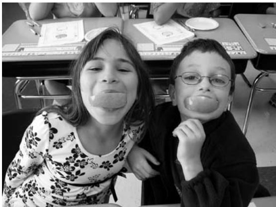
Learning about apples is a popular subject for Hawthorn second grade students.

Nonprofit Org. U.S. Postage PAID Mundelein IL Permit No. 211