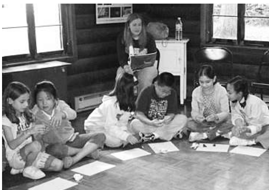
During a unit in which they study the prairie, third grade students visit Lake County Forest Preserves.

Residents are reminded that Board of Education meetings are rebroadcast on Vernon Hills cable, channel 4, at 6:30 p.m. on Wednesdays and 4:00 p.m. on Saturdays following board meetings. Residents who do not receive this channel are welcome to check out videotapes of the meetings from the Educational Services Center.