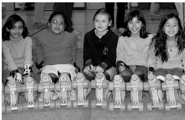
Roller skating is a favorite physical education unit for students in the Hawthorn elementary schools.

841 West End Court Vernon Hills, Illinois 60061