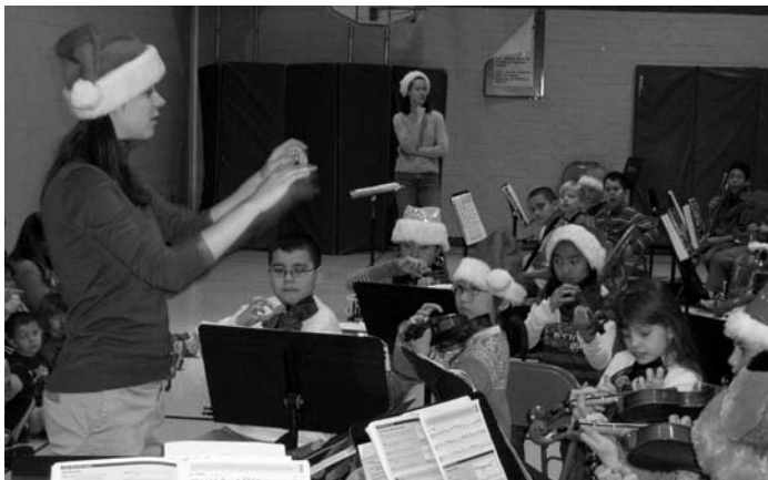
During the month of December, music filled the air at the Hawthorn Schools as both elementary and middle school instrumental music students performed concerts.

Residents are reminded that Board of Education meetings are rebroadcast on Vernon Hills cable, channel 4, at 6:30 p.m. on Wednesdays and 4:00 p.m. on Saturdays following board meetings. Residents who do not receive this channel are welcome to check out DVDs of the meetings from the Educational Services Center.