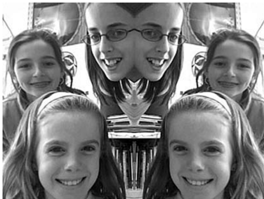
Fifth grade students relate geometry to various art-forms. This picture shows how some of them worked with mirror-image photography. They got a notion about how they would look if they had identical twins.

841 West End Court Vernon Hills, Illinois 60061