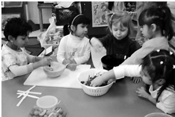
Hawthorn's youngest, the three-year-old prekindergartners pictured here, completed a unit that was centered on foods. In learning about how to eat well, they measured, mixed, sliced, rolled, and tasted a variety of foods. Several parents assisted with the classroom activities.