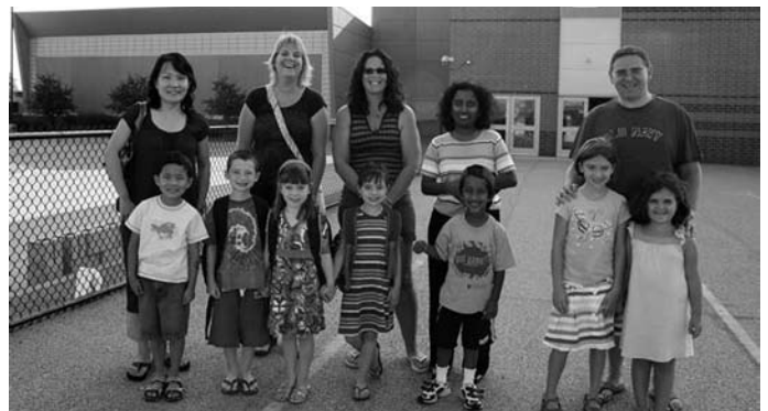
Pictured here are some of the about-to-be kindergarten students and their parents who took part in the Hawthorn Kinder Practice Bus Ride. After riding the bus to school, they were given a tour of the school and then bused home.

Board of Education meetings are rebroadcast on Vernon Hills cable, channel 4, at 6:30 p.m. on Wednesdays and 4:00 p.m. on Saturdays following board meetings. Residents who do not receive this channel are welcome to check out tapes of the meetings from the Educational Services Center.